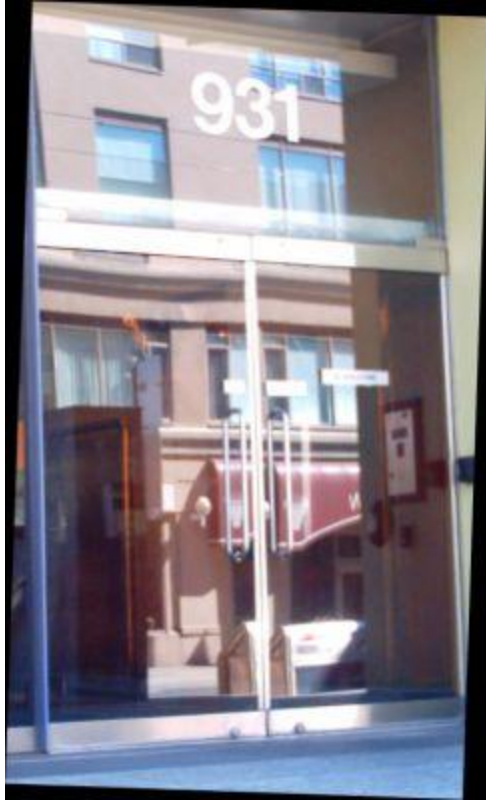
Title: Front Door at 931 Yonge, TCHC's Rosedale Headquarters

Two weeks later, on the last day of August, OCAP organized another news conference this time at the Rosedale HQ of TCHC. The interior is resplendent. The protesters and tenant were invited to wait in a small boardroom and eventually the Executive Assistance to the C.O.O. of TCHC came in to discuss the issues. She agreed to arrange a meeting, OCAP's simple request to help the tenant. It shouldn't have taken over two weeks to get a meeting but thanks to the antics at 100 High Park it was necessary.