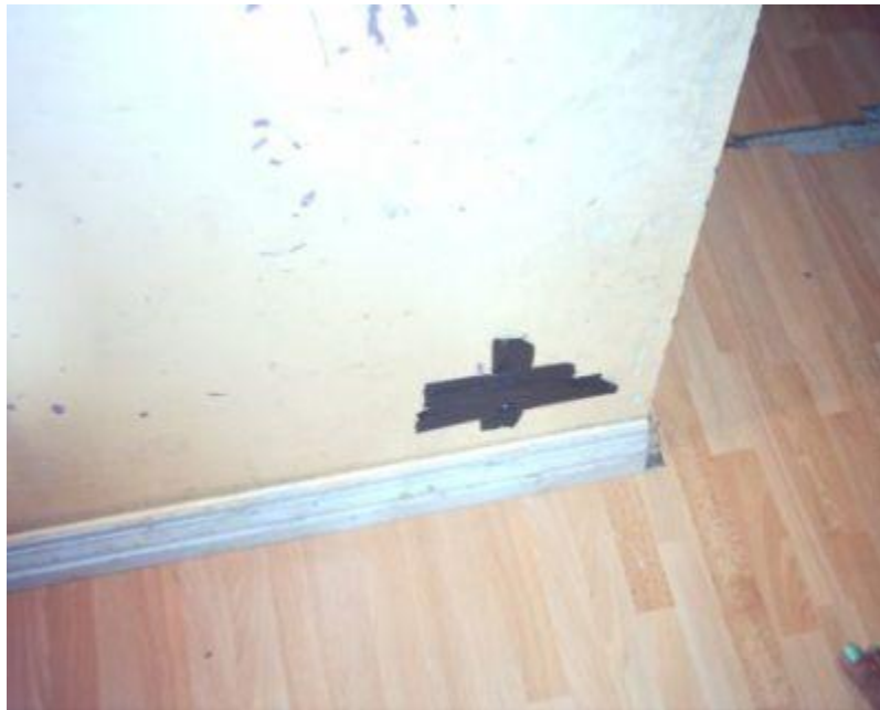
Title: Electrical Outlet that causes full power outage in Swansea Mews when someone walked past it.