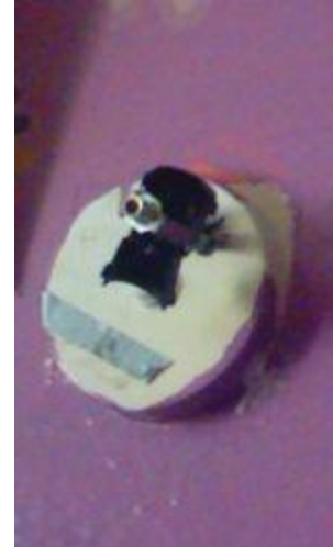
Title: Light Fixture at Swansea Mew that caught fire three years ago and has never been repaired.

Three years ago a light fixture caught on fire burning one of Vi's children. It has never been repaired. Vi wrapped a towel around it to prevent further injury to her children.