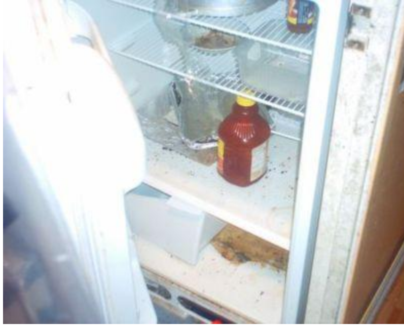
Title: Mice and Rodent Droppings in Fridge at Swansea Mews