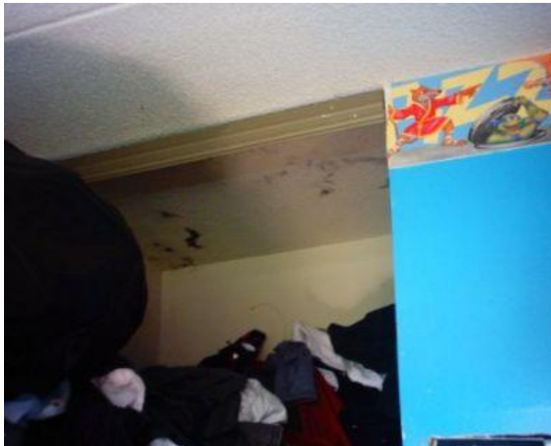
Title: Black Mould in Closet at Swansea Mews

"The tenant, on questioning, indicated to me that she has lived in the unit for 15 years, and has complained about these problems to her landlord on numerous and repeated occasions over the past 5-6 years. In most cases, no action was taken, and the problems have become consistently worse.